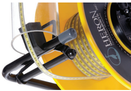
Figure 3 Hanger to support the meter at the well head. Tape Guide to protect the tape from sharp edges.